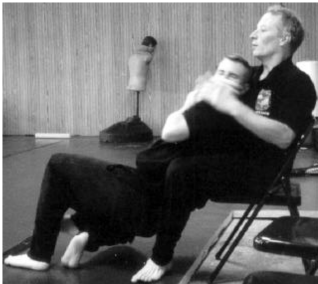
Waco continued. Professor demonstrates a smother and choke.